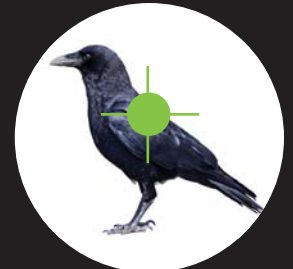
Crows and rooks